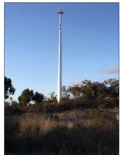
NBN Tower at Honeyeater Reserve