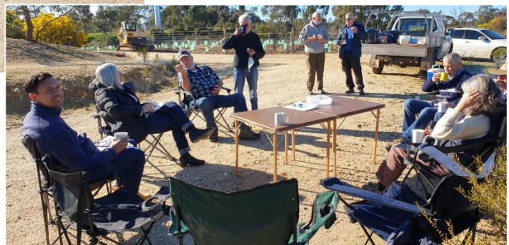
Meeting with Councillors at Honeyeater Bushland Reserve. July 2021