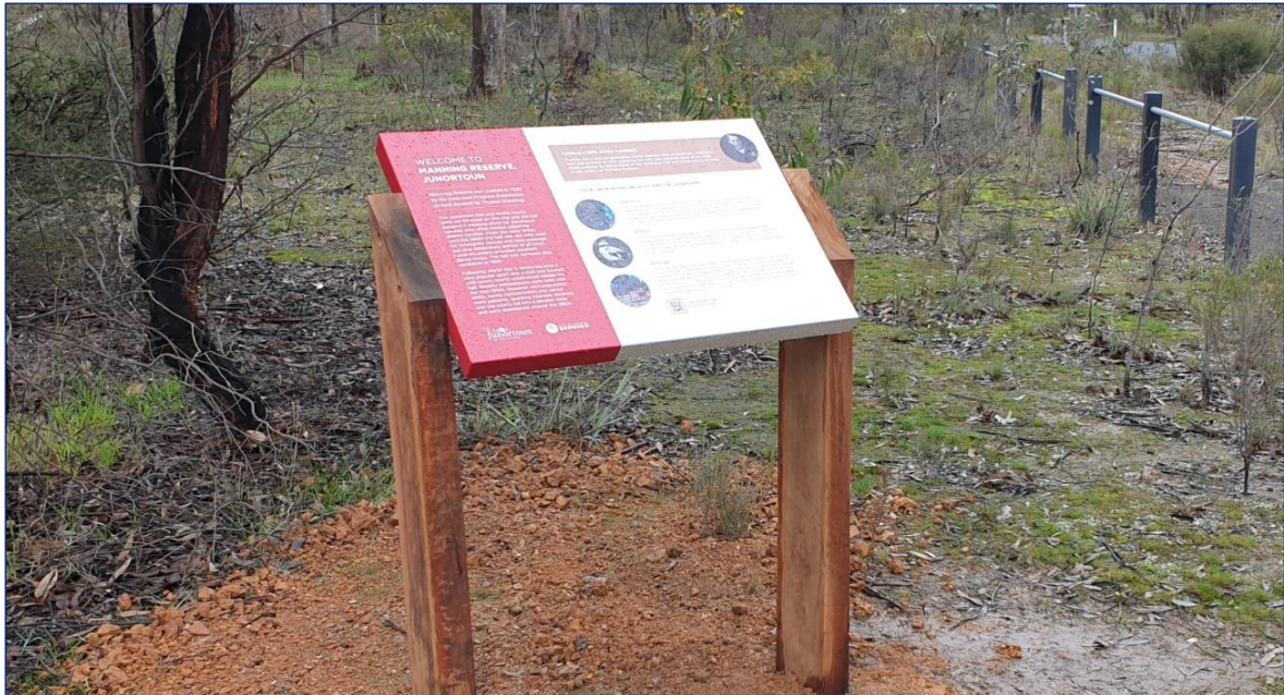
Historic and interpretive sign installed at Manning Reserve June 2021.