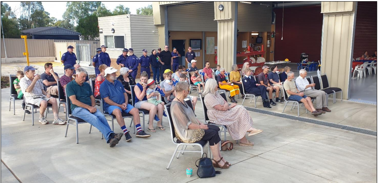
Australia Day breakfast 2023